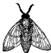
Figure 3: A sample black and white graphic that has been resized with the includegraphics command.

It is strongly recommended to use the package booktabs [Fear 2005] and follow its main principles of typography with respect to tables: